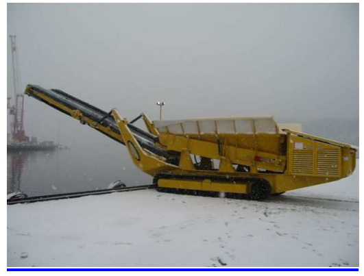
Used at the docks, the hopper buffers and takes care of a even load flow into the vessel.